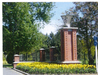
Queens Drive Entrance

Queens Park has been classified as one of only three Premier Parks within the Invercargill City Council park categories (the others are Anderson Park and the Otepunu Gardens). Parks are categorised according to their dominant characteristics and these assist Council with setting management objectives and assessing funding requirements for each reserve. The Premier Parks are the City's top parks providing formal gardens and horticultural displays for local and visitor use and enjoyment. Maintained to a very high amenity standard, Premier Parks are the principal gardens of Invercargill City.